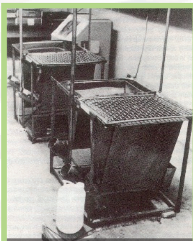
Harry Harlow's "Pit of Despair" Small, metal inverted pyramids designed to induce depression. After a couple of days, the 3mth old monkeys gave up and hardly moved.